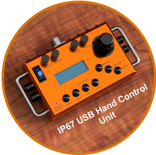
IP67 USB Hand Control Unit