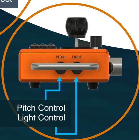
Pitch Control Light Control