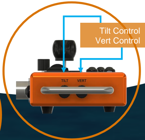
Tilt Control Vert Control